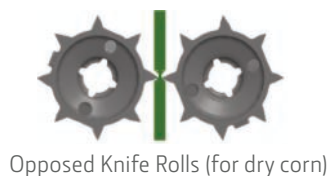
Opposed Knife Rolls (for dry corn)

RowMax also includes your choice of stalk rolls.