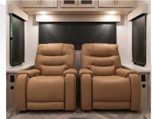
7-Way Ashley Furniture Electric Recliners (3102RSWB & 3902MBWB—optional on 3102RSWB & 3902MBWB)