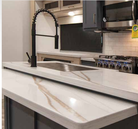
Solid Surface Countertops