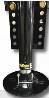
6 Point Electric Auto Level