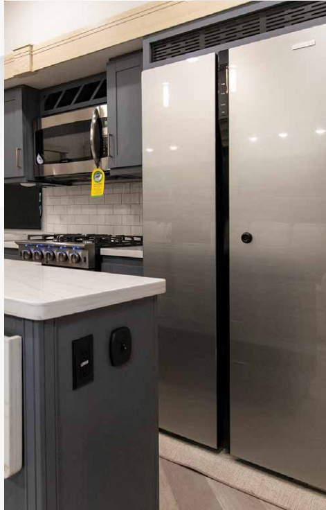
16 CU FT 12V Refrigerator