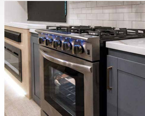
24" Residentially Inspired 4-Burner Stove