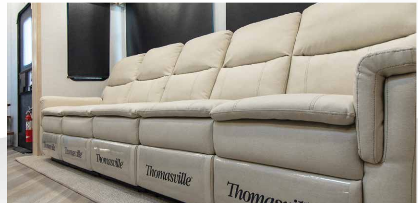
Super Sofa with 5 Reclining Seats (3602DSWB and 3952FBWB)