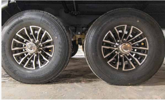
TST Tire Monitoring System with G-Rated Tires