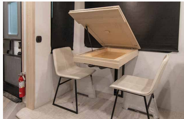
Flip-up Dinette Storage