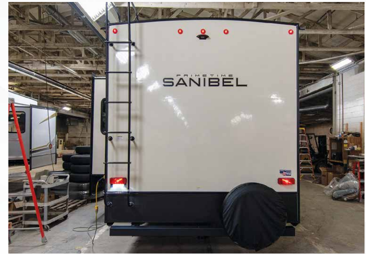
100" Wide Body Construction