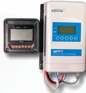
190 Watt Solar Panel with 30 AMP Charge Controller and Roof Prep for a 2nd Solar Panel