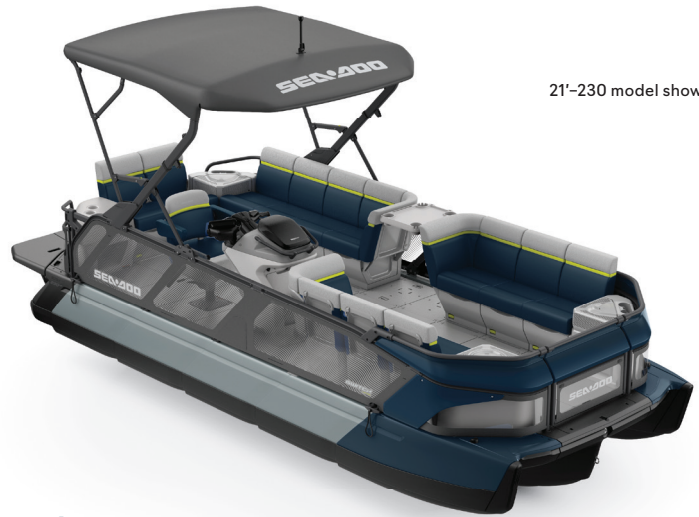
21'-230 model shown