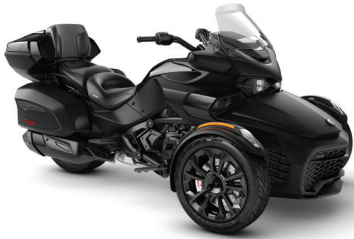
■ MONOLITH BLACK SATIN DARK*