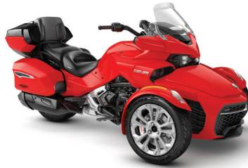
■ PLASMA RED PLATINUM*