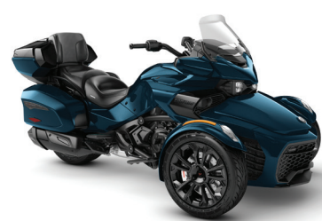
■ PETROL METALLIC DARK*