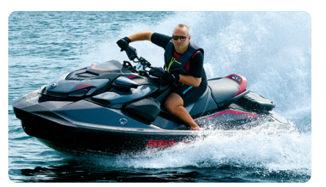
Ergolock Two-Piece Racing Seat Tacky surface and back support enhances grip during performance riding.