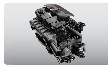
Rotax 1630 ACE - 300 Engine The powerful Rotax 1630 ACE - 300 engine levels up your performance to your liking by delivering high efficiency and world-class acceleration.