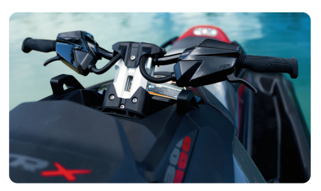
Low-Rise Racing Handlebars Creates a more streamlined, race oriented riding position.