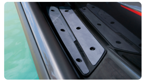
Angled Footwell Wedges Lined with premium carpets, provides superior foot grip.

This moderate V-shaped hull guarantees a stable, enjoyable ride in variable water conditions. Confident, predictable handling but incredibly playful when you want it to be.