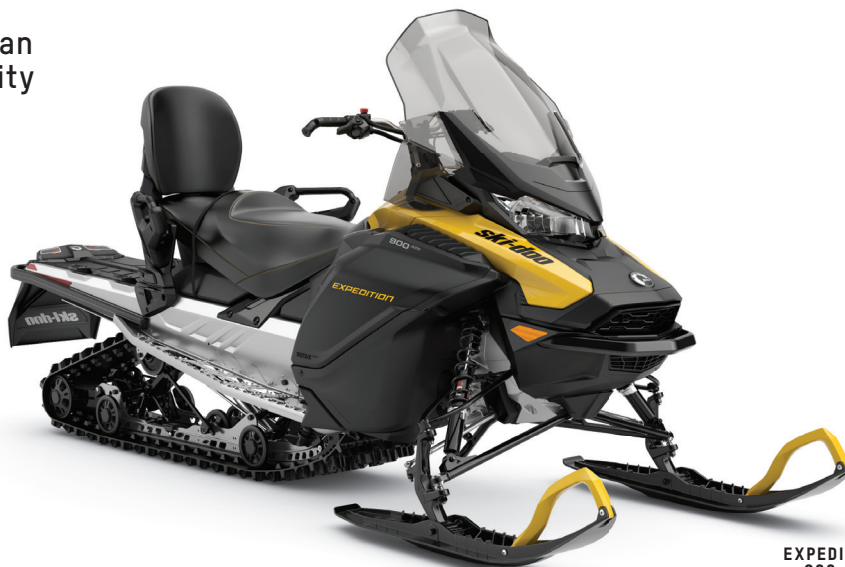
EXPEDITION SPORT 900 ACE SHOWN

Ultra-responsive chassis for on- or off-trail rides and an extensive array of sport-utility and 2-up features.