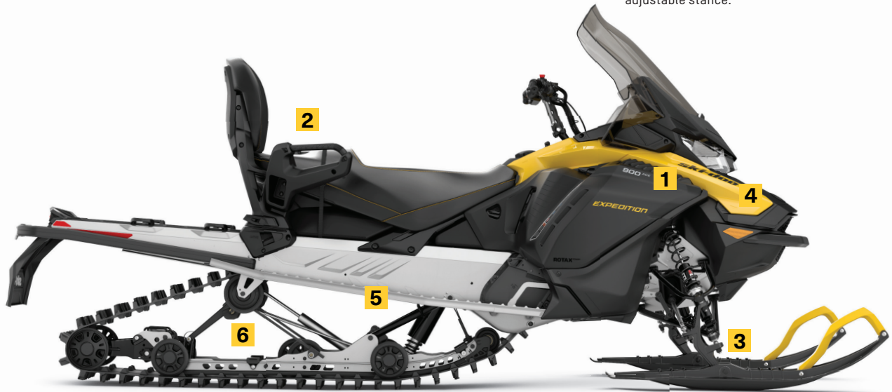
EXPEDITION SPORT 900 ACE SHOWN

An updated version of our RAS X trail front end for capability on- and off-trail. Light steering feel optimized for crossover usage with adjustable stance.