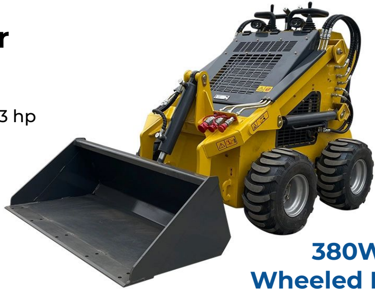
380W Wheeled Model