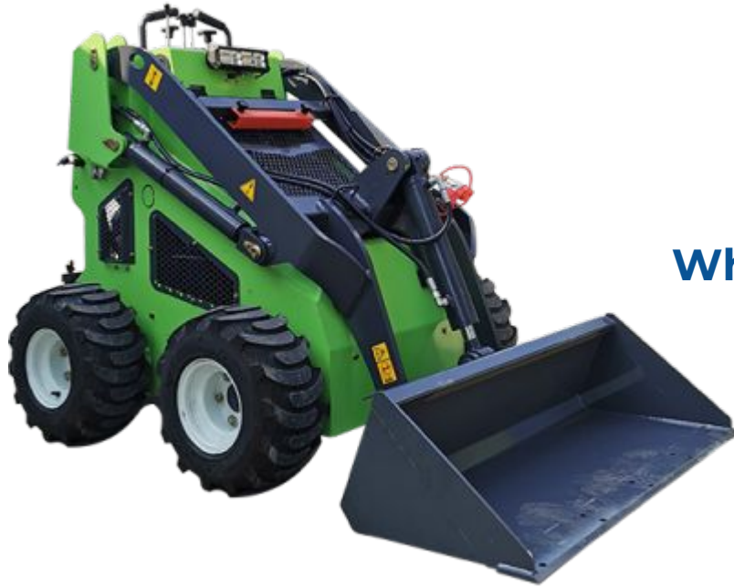
430W Wheeled Model